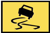
T3-3 A-900x600 B- 1500x900

AVAILABLE IN ENGINEER GRADE, HI INTENSITY & DIAMOND GRADE REFLECTIVE MATERIALS