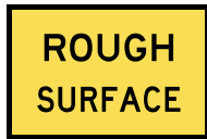
T3-7 A-900x600 B- 1500x750