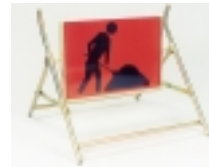
WLM STAND 600x600