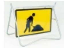
QUADRAPED STAND A-600x400 B- 600x600 C-900x600 D-1200x900