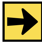
T5-6 A-450x450 B- 600x600