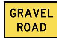
T3-13 A-900x600 B- 1500x750