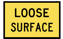
T3-14 A-900x600 B- 1500x750